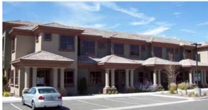
9080 DOUBLE DIAMOND PKWY ASKING PRICE OF $88 PSF (SHELL)