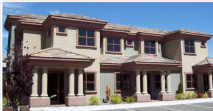
9090 DOUBLE DIAMOND PKWY ASKING PRICE OF $88 PSF (SHELL)

The information furnished has been obtained from sources we deem reliable and is submitted subject to errors, omissions and changes. Although Colliers Nevada, LLC has no reason to doubt its accuracy, we do not guarantee it. All information should be verified by the recipient prior to lease, purchase, exchange or execution of legal documents.