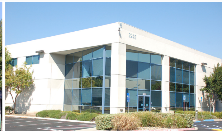
2245 Lundy Avenue

For Further Information, Please Contact: