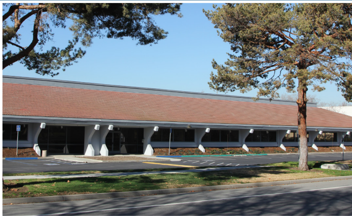
2241 Lundy Avenue