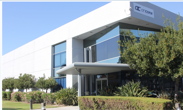
2243 Lundy Avenue