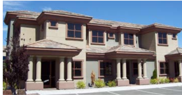
9060 DOUBLE DIAMOND PKWY ASKING PRICE OF $110 PSF