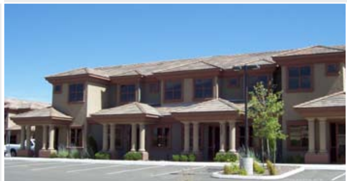
9090 DOUBLE DIAMOND PKWY ASKING PRICE OF $110 PSF

The information furnished has been obtained from sources we deem reliable and is submitted subject to errors, omissions and changes. Although Colliers Nevada, LLC has no reason to doubt its accuracy, we do not guarantee it. All information should be verified by the recipient prior to lease, purchase, exchange or execution of legal documents.